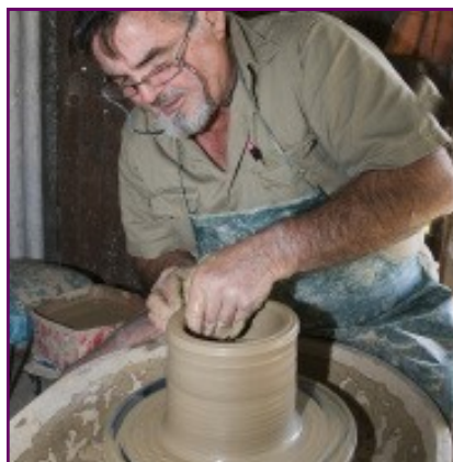
"Like clay in the hands

was an advantage as the red sandy loam country produced immediate pick for the stock [cattle and sheep to city slickers] and by the time this burnt off, the gilgai holes would be growing fodder. The black soil river flats produced feed between these two types of country.