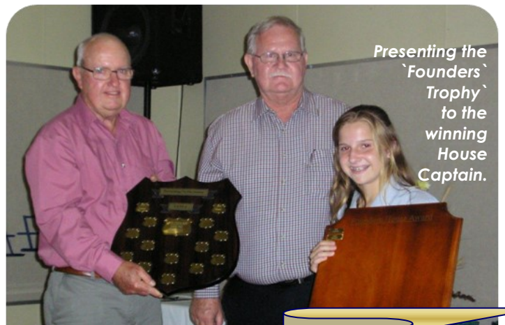
Presenting the `Founders` Trophy` to the winning House Captain.

PER VOLAR SONATA – PATRIBUS DIGNI ESTOTE: Born to fly upwards – Be worthy of our forebears