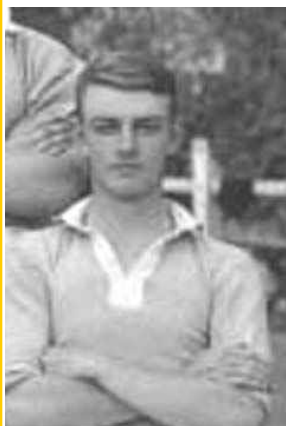
The school boy