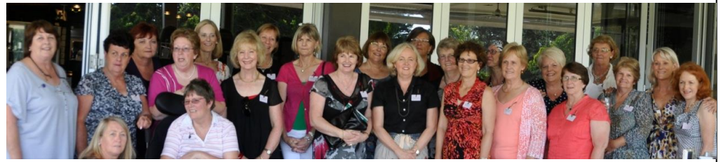
The class of '69 – Can you match the faces with the list of attendees on Page 2?