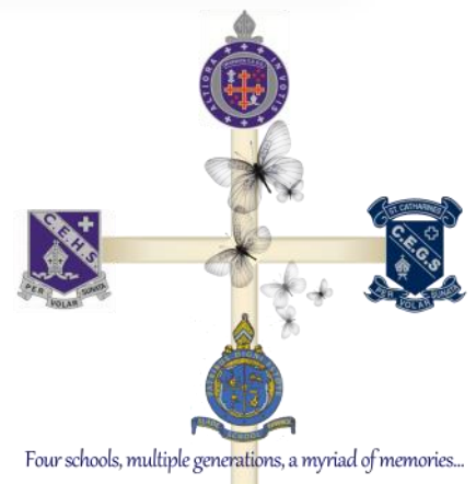
Four schools, multiple generations, a myriad of memories...

BSB 514179 Account Name Mrs Helen L Moloney Account Number 1214350 Reference 100 yr Pics plus YOUR NAME